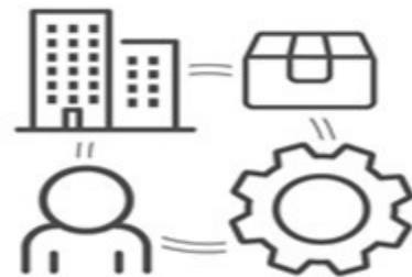
SCOPE 3 Other indirect emissions Supply Chain, employee travel and embodies carbon