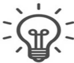
SCOPE 2 Indirect emissions Company-used electricity and energy genration