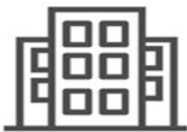
SCOPE 1 Direct emissions Company-owned buildings and equipments

The carbon footprint accounts for and reports on the following Scope 1, Scope 2 & Scope 3 emission Sources: